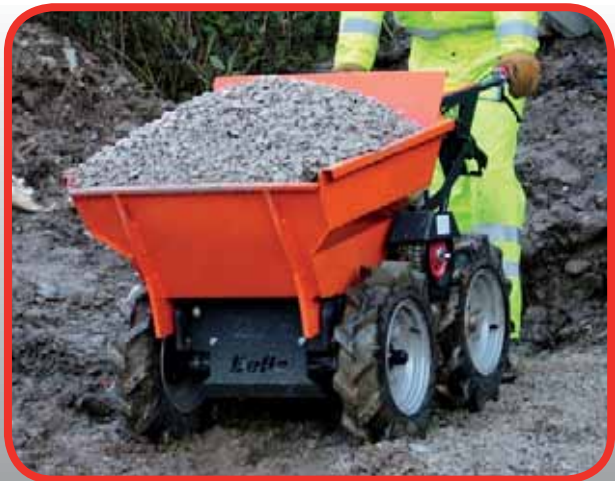
Large Skip carries up to 300Kg