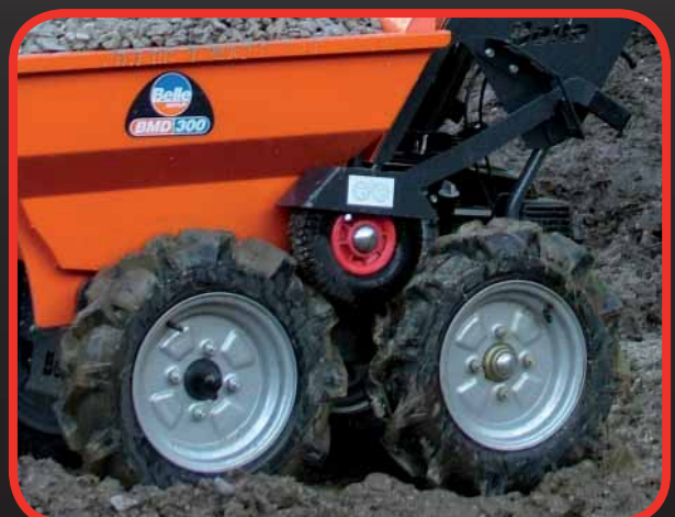
Carrier wheel disengages for easy wheel change