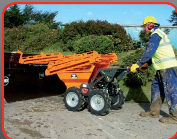
Ridged Skip Loading Ramps