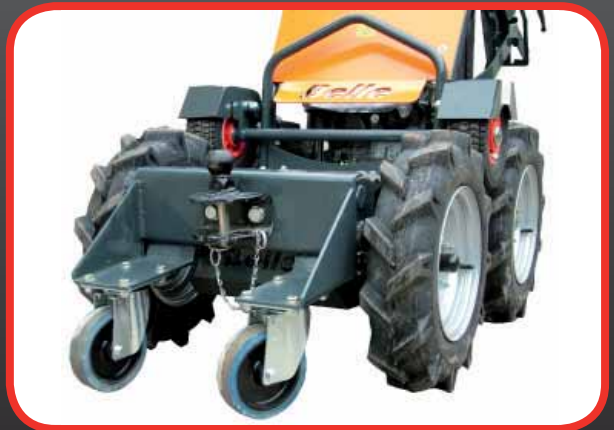
Towing Ball Option