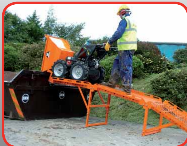
Enables Tipping Directly Into Skip