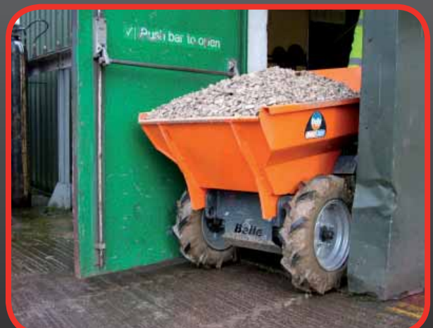
Designed to fit through doorways