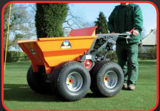
Turf Tyre Option