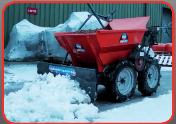
Snow Plough Option