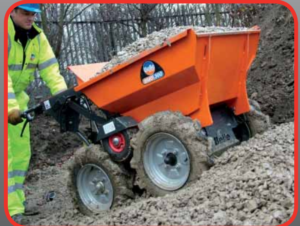
Steep gradients when fully loaded